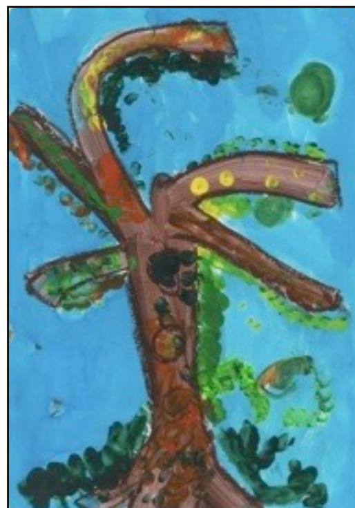
An Autumn tree. Bailey Rm 7

"Our core business is learning and teaching."